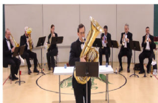
Lawrence County Brass