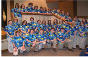
Greenville Steel Drum Band