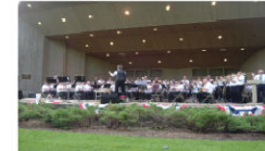
Mercer Community Band at the Buhl Park Bandstand