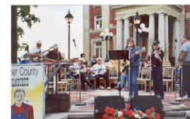
Mercer County Jamboree

In case of inclement weather, concerts will be held at the Mercer High School Auditorium