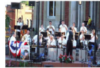
Mercer Community Jazz Band