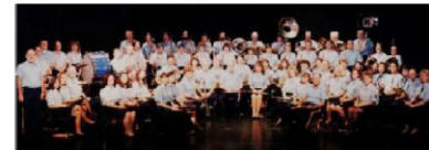
Franklin Silver Cornet Band