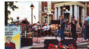
Mercer County Jamboree