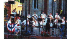
Mercer Community Jazz Band