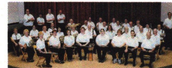
Youngstown Area Community Concert Band

Erie Heights Brass Ensemble, warmup music Youngstown Community Band Immaculate Heart of Mary Ice Cream Social