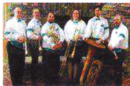
Erie Heights Brass Ensemble

In case of inclement weather, concerts will be held at the Mercer High School Auditorium