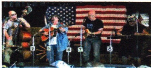
Still House Pickers