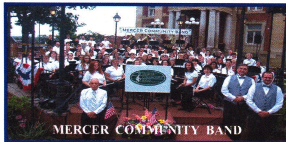
MERCER COMMUNITY BAND